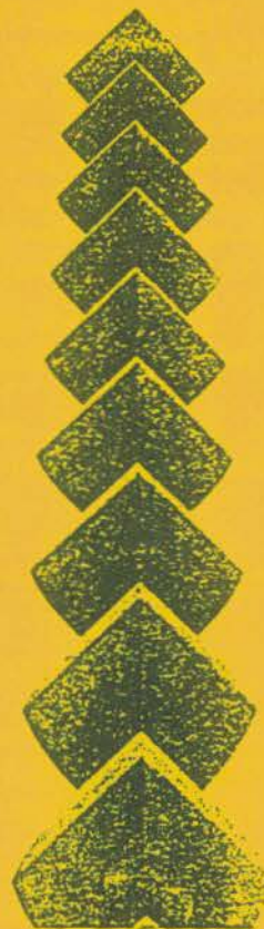
Endless Column, 1937, cast iron CONSTANTIN BRĂNCUȘI