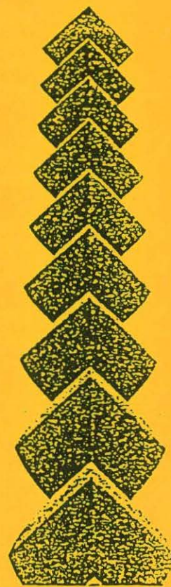
Endless Column, 1937, cast iron CONSTANTIN BRĂNCUȘI