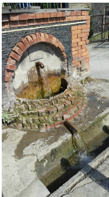
Figure 2. Borehole water in village street (Village Kalauri)