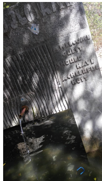
Figure 3. Borehole water on the highway (Village Chalaubani)