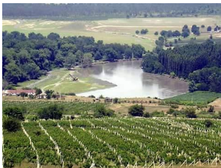
Figure 4. Alazani River

The chemical composition of the Alazani river (Figure 4) was also studied during the research process. It is one of the significant rivers of east Georgia, with a length of 390 km, catchment area – 11800 sq.km. River head is located on the Greater Caucasus mountain range, on the eastern slope of peak Great Borbalo. In the upstream it is a mountain river, flowing down to Alazani valley, developing the branches and joining the Mingechauri Reservoir (Azerbaijani). Before reservoir construction, Alazani used to stream down directly into Mtkvari River. Adjacent planes of the Alazani River belong to the vine-