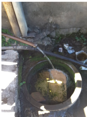
Figure 1. Borehole water in one of the village dwellers' yards (village Vazisubani)

taps) is used for washing (including, for washing food products) and watering the house gardens.