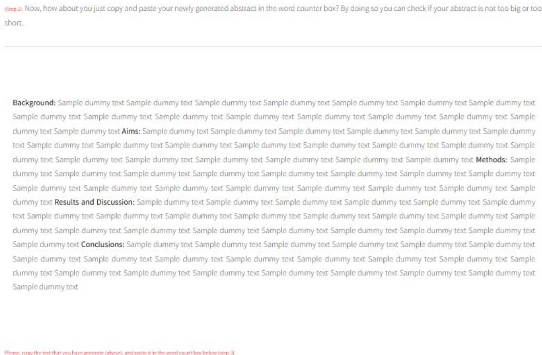
Figure 3. Paragraph preview.

After pressing the submit button, the authors should go to step 2. In step 2, it is possible to see the abstract generated with the previously informed text, according to Figure 3.